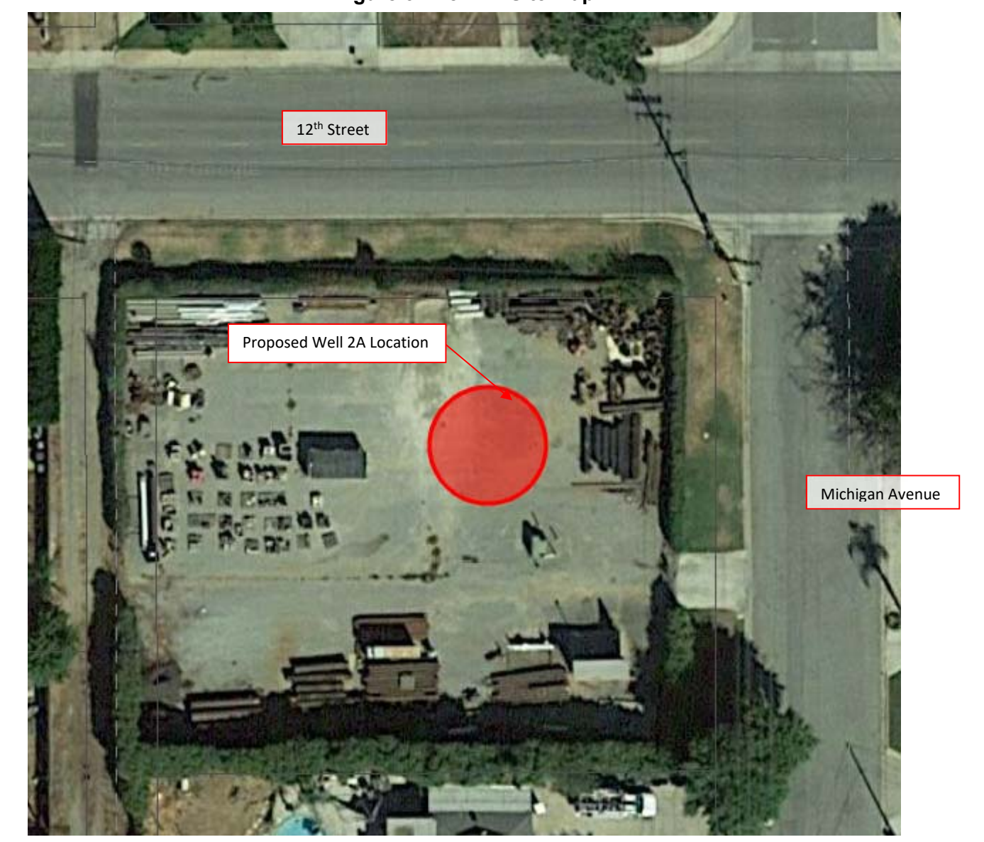
Figure 3: Well 2A Site Map