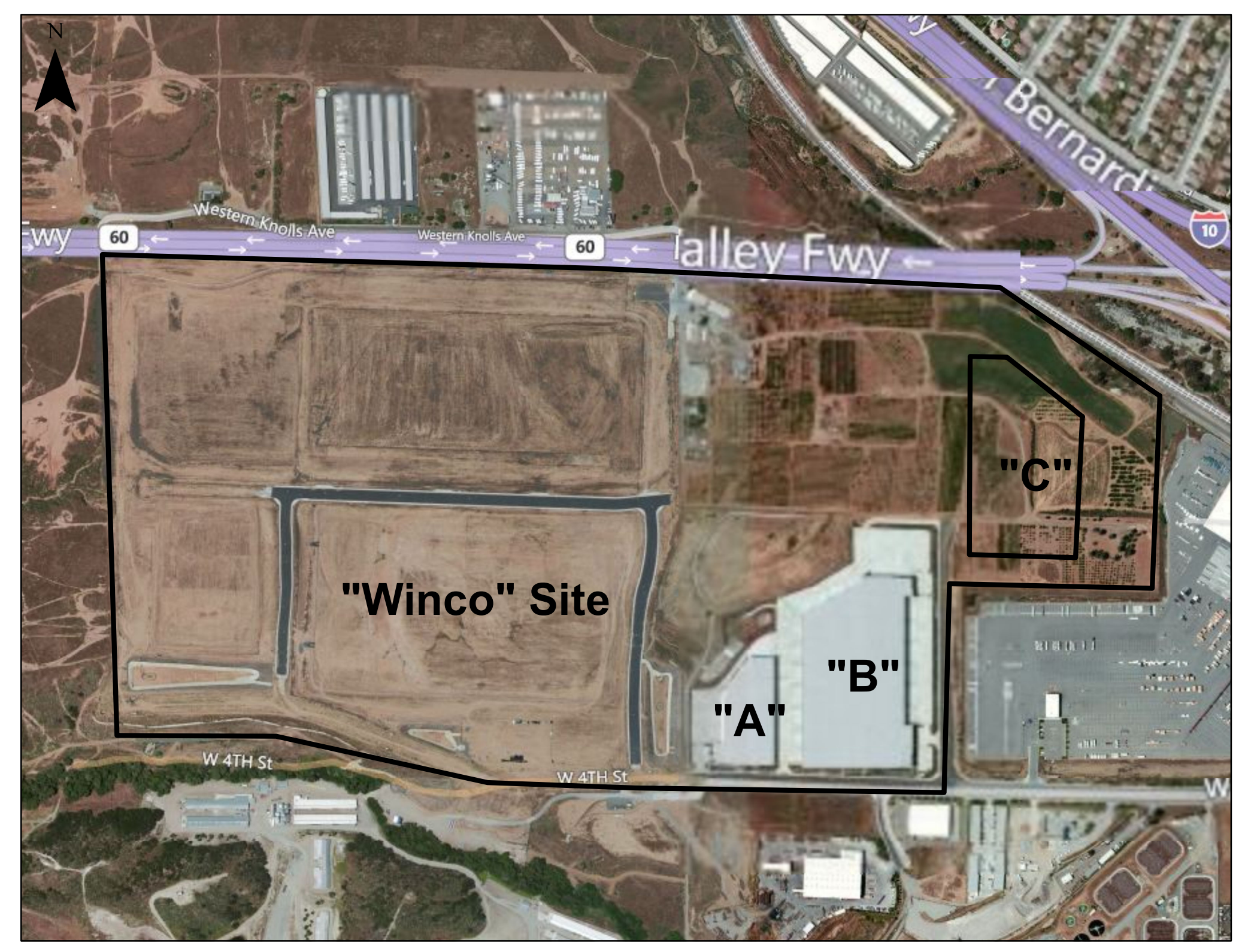
Page 28 of 31 of the Regular Meeting Agenda