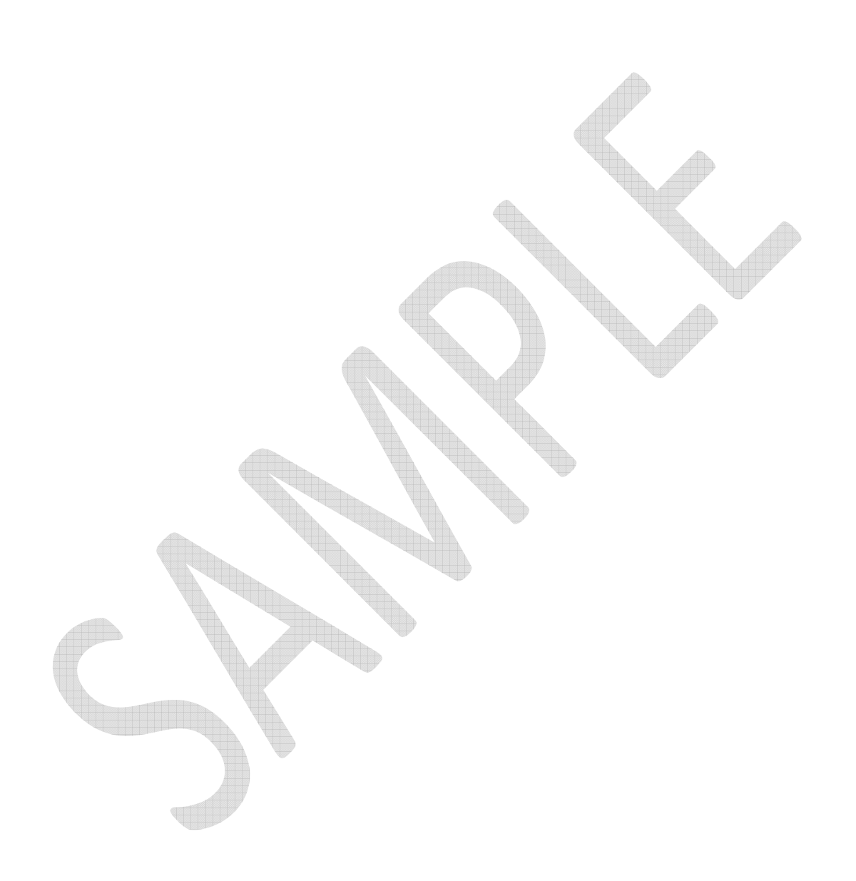
EXHIBIT A Scope of Services