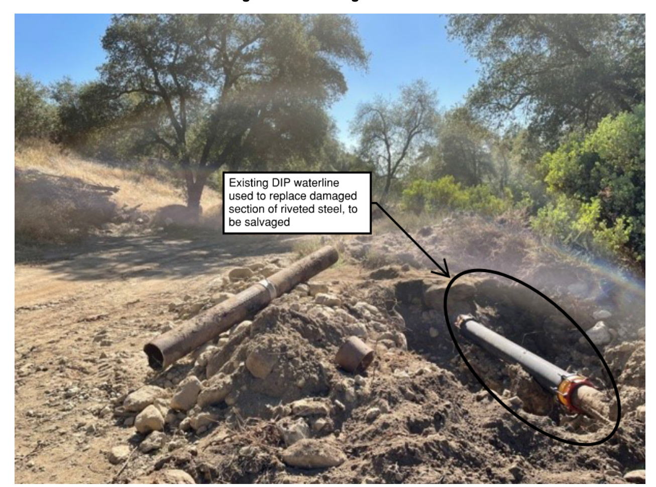
Figure 6 – Existing Waterline

Note: There are various sections of the existing waterline where the riveted steel has failed and has been replaced with sections of DIP. In these instances, the DIP may be salvaged for District use. This image is looking southerly along the District's access road.