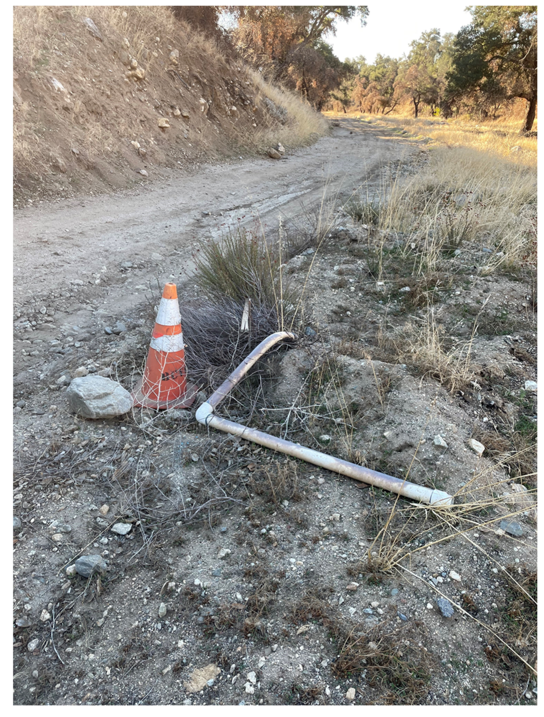
Figure 3 – "B" Line Southern Connection Location

Note: The southern connection point of the proposed pipeline replacement is identified by a traffic cone, meter box, and PVC pipe. This image is looking southerly along the District's access road.