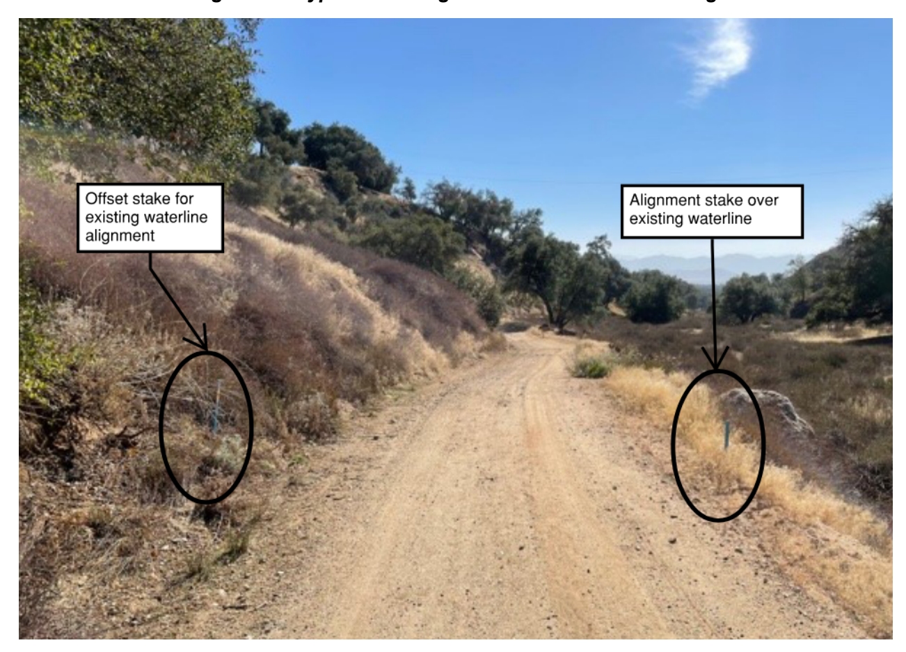
Figure 4 – Typical Existing Waterline Location Staking

Note: The alignment of the existing waterline to be replaced is marked with stakes along the alignment as well as by an offset from the east side of the access road. This image is looking southerly along the District's access road.