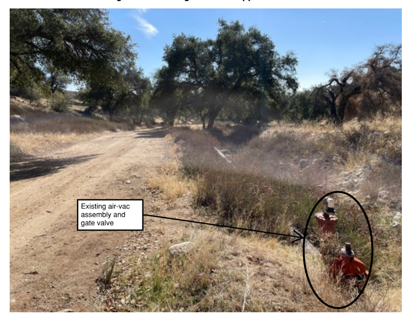
Figure 5 – Existing Waterline Appurtenances

Note: There is one air-vac assembly and one gate valve along the existing waterline. It is District preference to install at a minimum one valve per 1,000 ft along transmission pipelines. Also note that there are several mature oak trees which line the access road; this may be the causation of environmental mitigation as discussed previously in this RFP. This image is looking southerly along the District's access road.