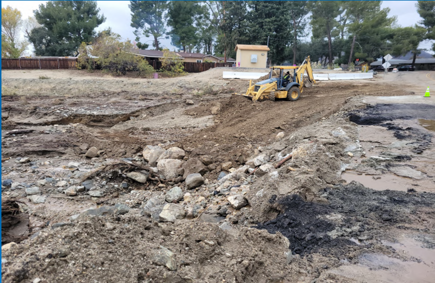
Location of exposed CML&C waterline in Noble Street at the Noble Creek crossing. During District temporary emergency repairs (12/28/2021)