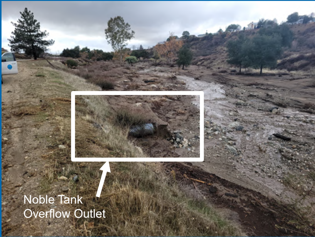
Noble Tank Overflow Outlet