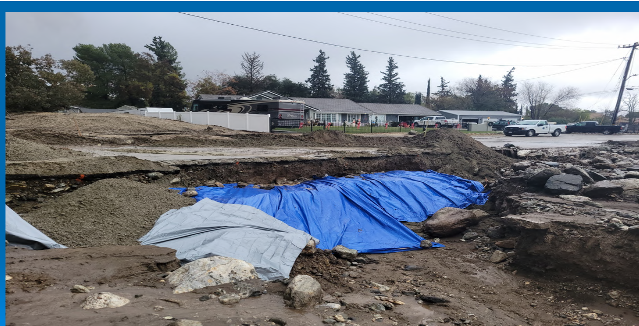
Location of exposed CML&C waterline in Noble Street at the Noble Creek crossing. During District temporary emergency repairs