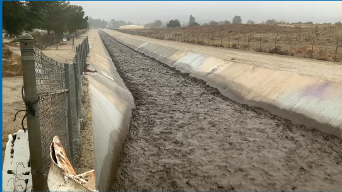
Noble Creek at the intersection of Beaumont Avenue, north of Brookside Avenue