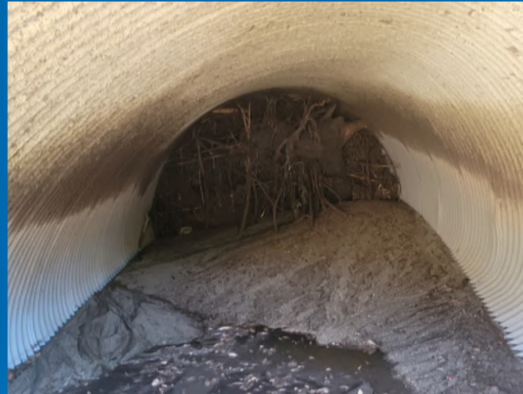
Inner view of the culvert under District access road