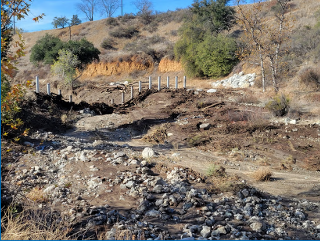
Noble Creek at the debris retainment system constructed by RCFC&WCD