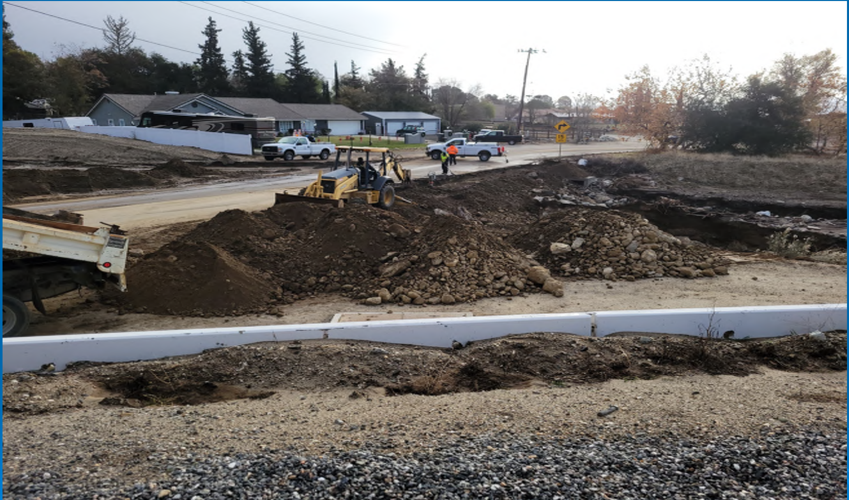
Location of exposed CML&C waterline in Noble Street at the Noble Creek crossing. During District temporary emergency repairs (12/27/2021)