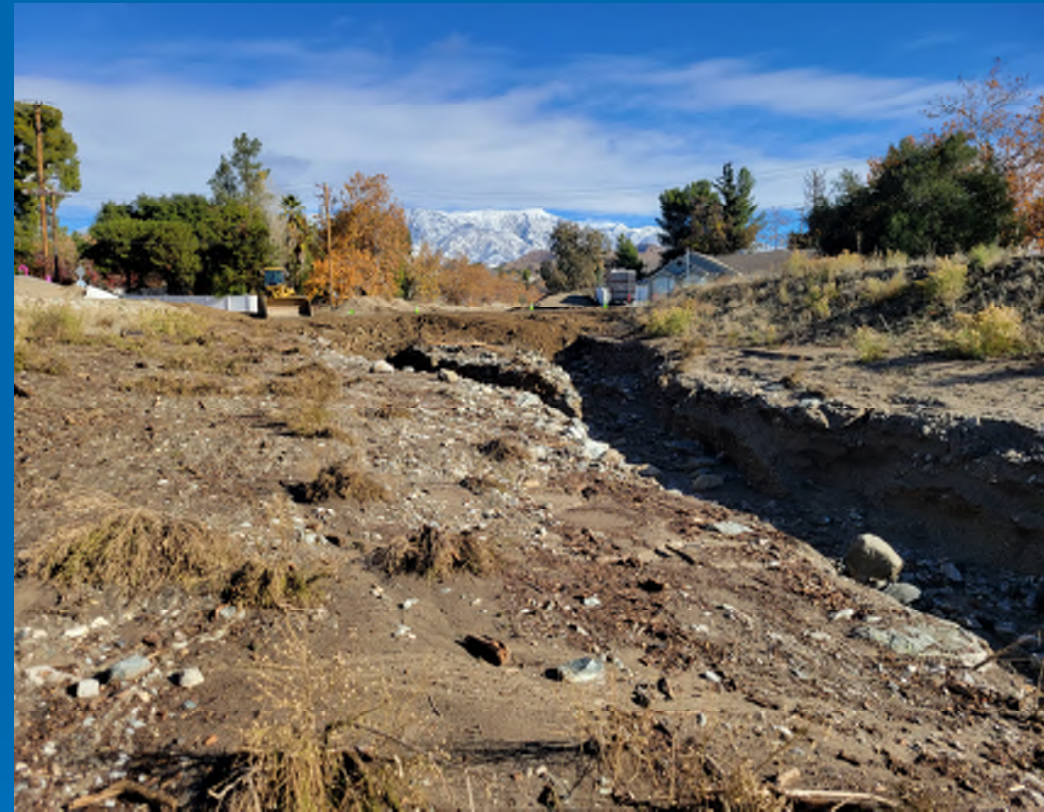
Location of exposed CML&C waterline in Noble Street at the Noble Creek crossing. During District temporary emergency repairs (12/29/2021)