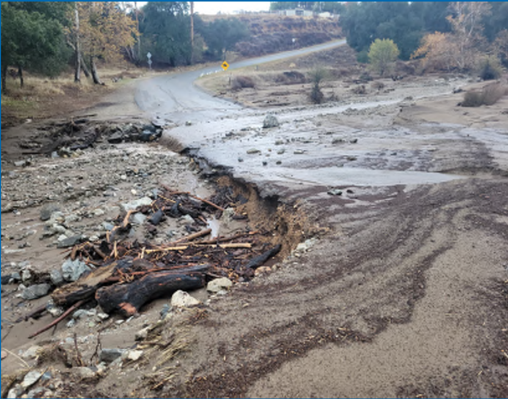
Noble Creek at Avenida Altura Bella, just north of the Noble Tank Site