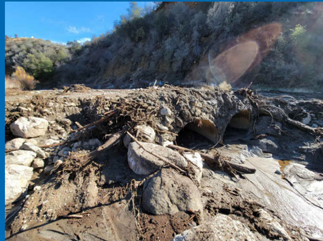
District's access road crossing Noble Creek in Edgar Canyon