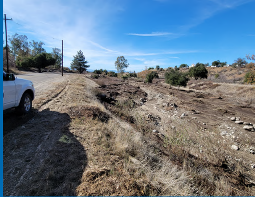
Noble Creek just west of the Noble Tank Site