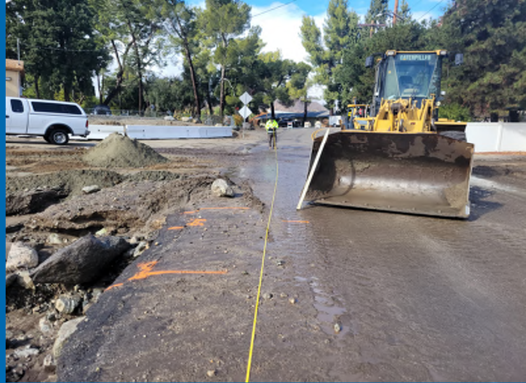
District staff taking field measurements