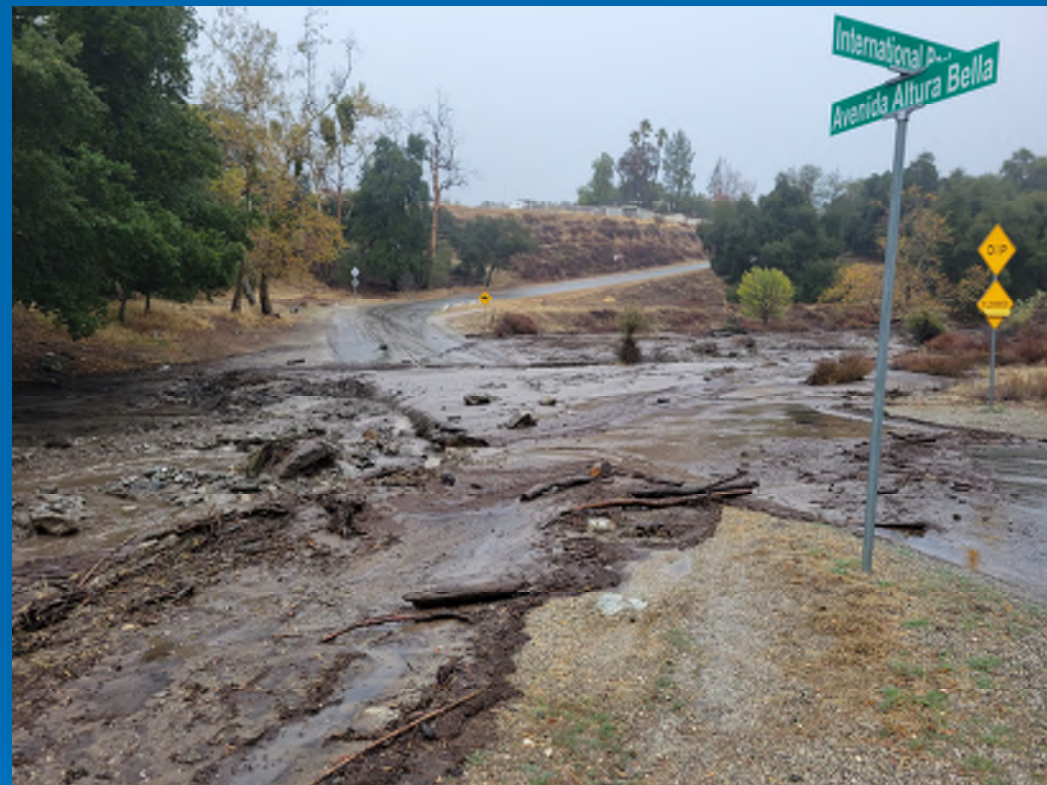
Noble Creek at Avenida Altura Bella, just north of the Noble Tank Site