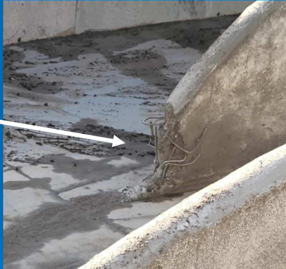
Noble Creek Channel at Beaumont Avenue crossing, north of Brookside Avenue