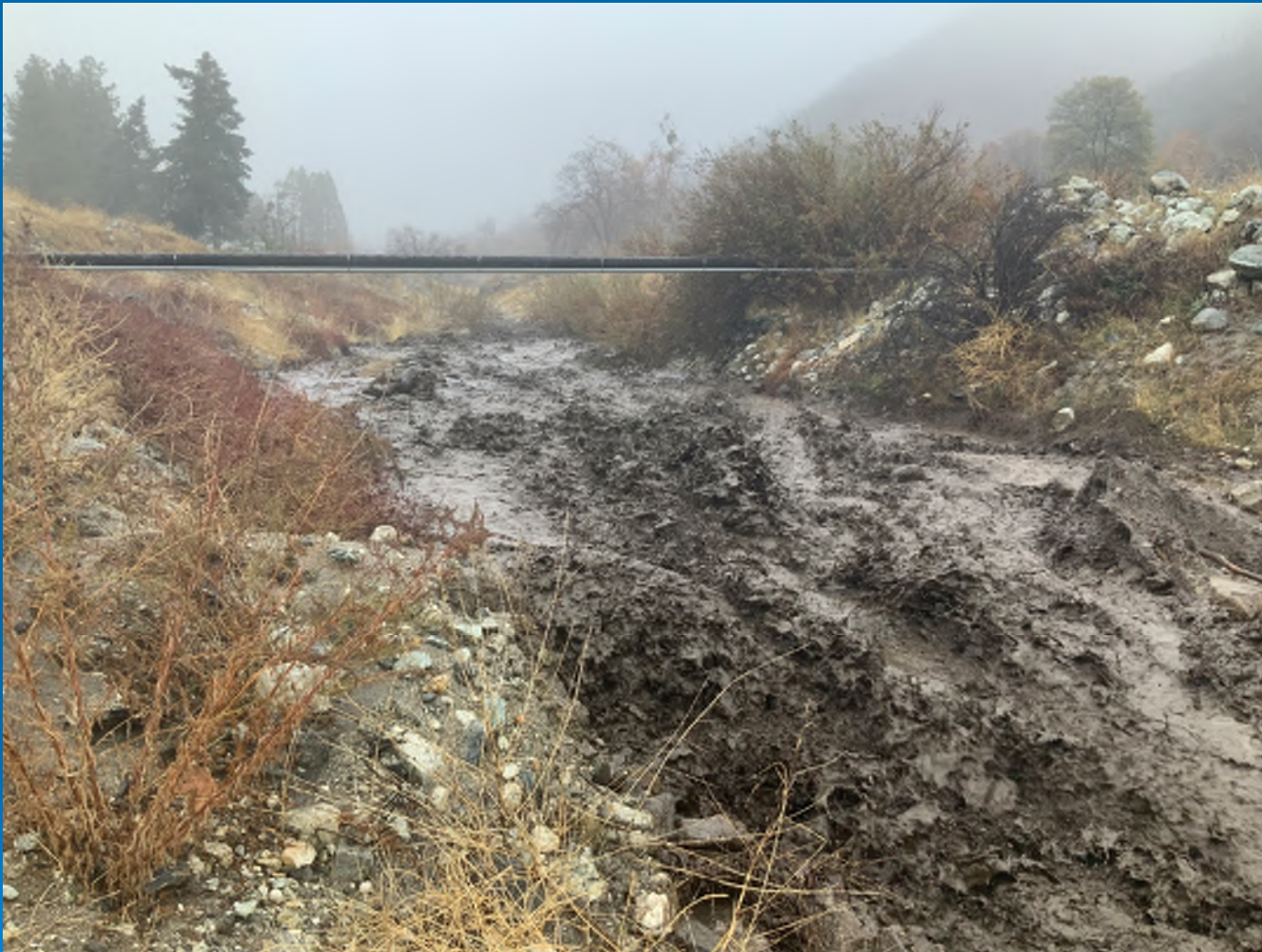
Mud flow in Edgar Canyon