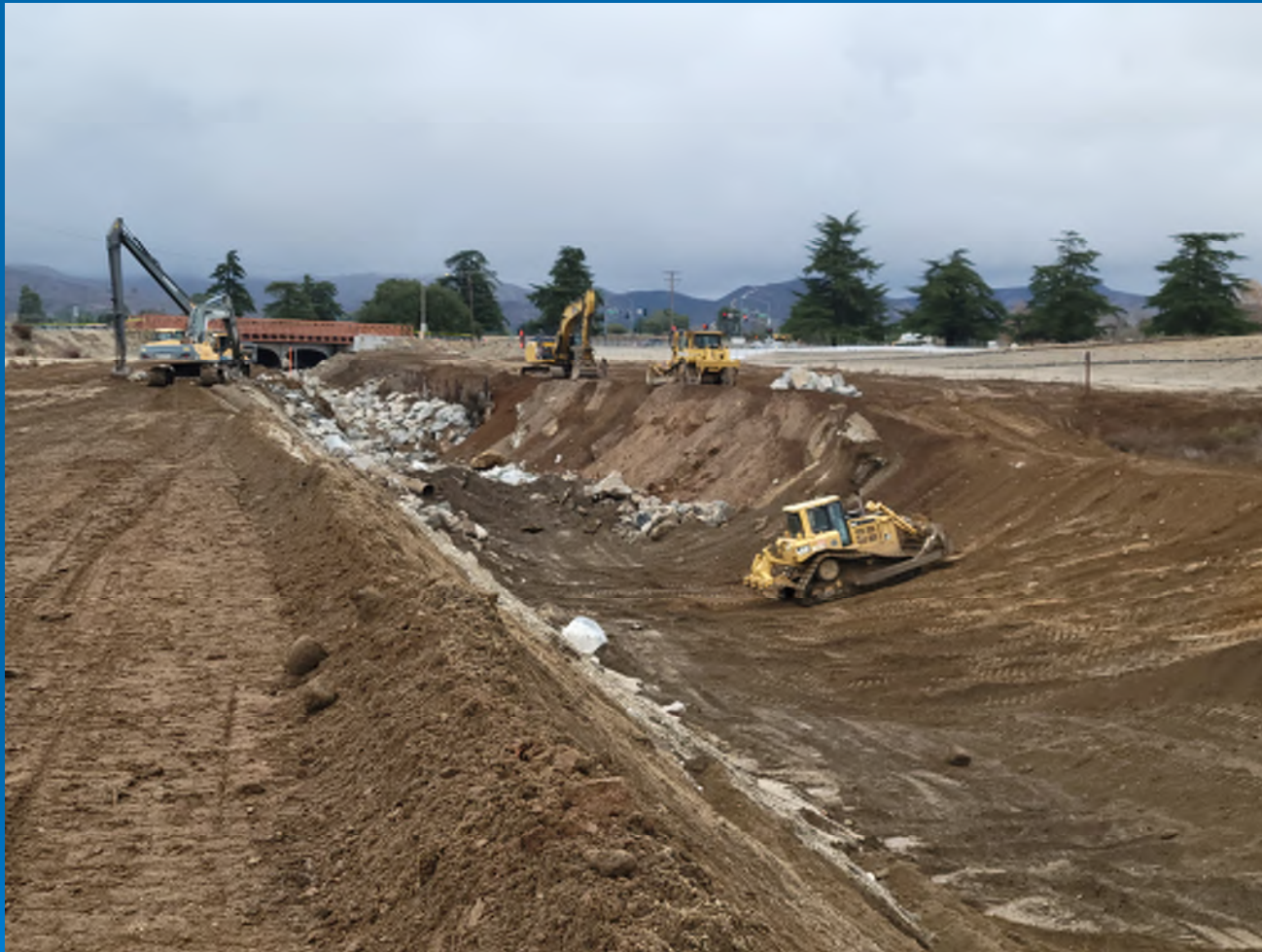
RCFC&WCD completing work on Noble Creek south of Brookside Avenue, west of Beaumont Avenue