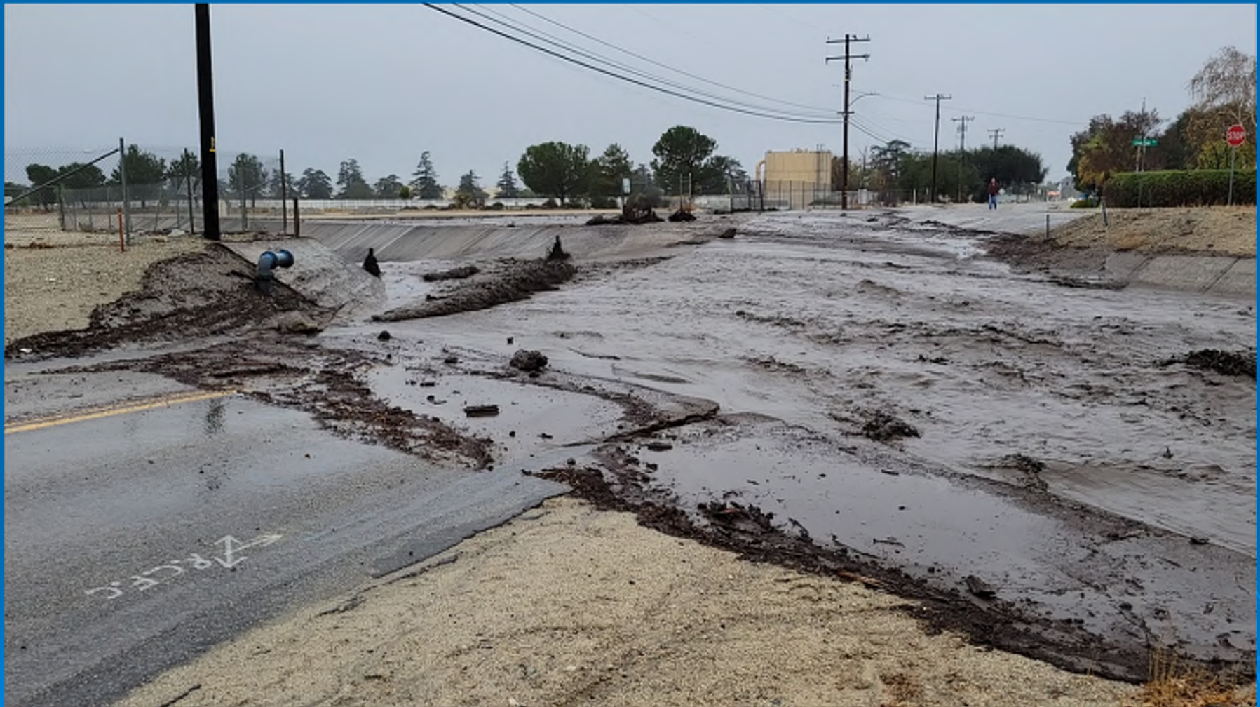
Noble Creek at the intersection of Cherry Valley Boulevard, east of the Noble Creek Recharge Facilities Phase I