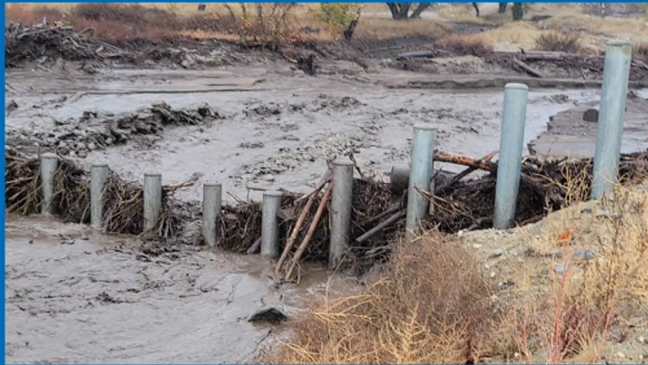
Mud flow in Noble Creek at the debris retention system constructed by Riverside County Flood Control and Water Conservation District (RCFC&WCD)