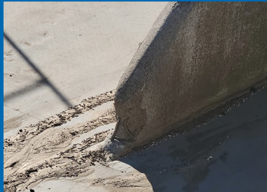
Noble Creek Channel at the Beaumont Avenue crossing, north of Brookside Avenue