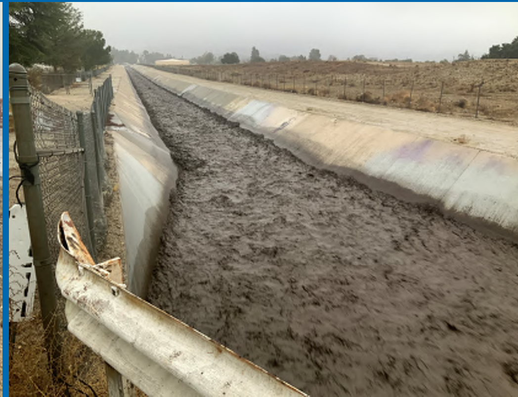
Noble Creek Channel, at the intersection of Beaumont Avenue north of Brookside Avenue