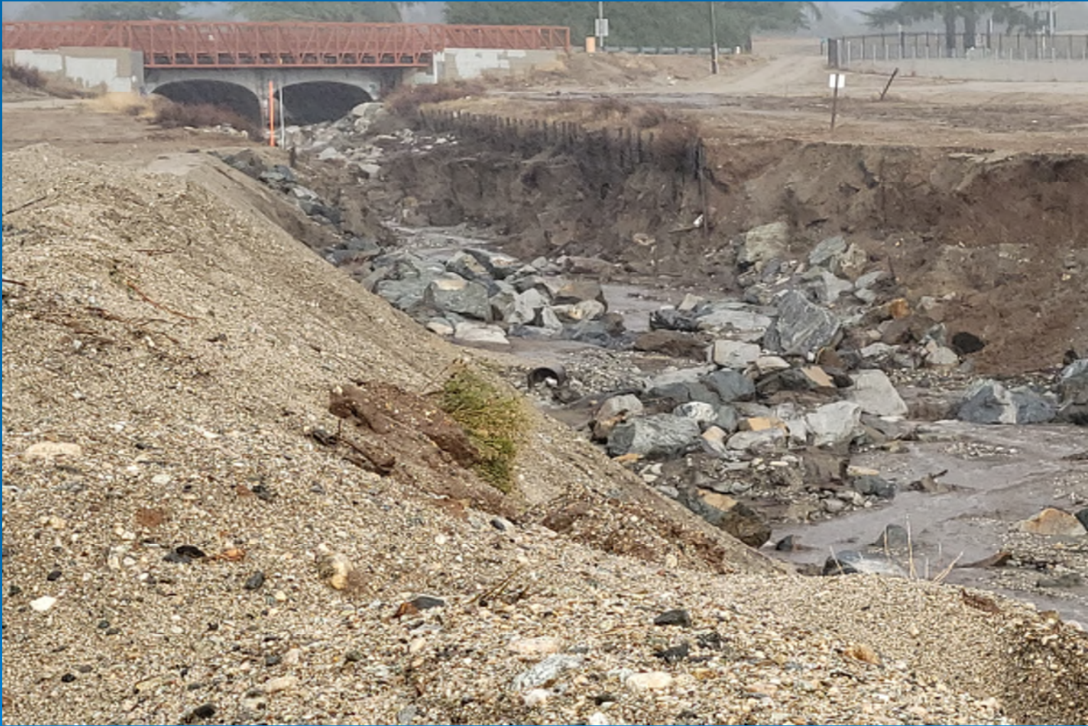
Noble Creek south of Brookside Avenue. Rip rap placed by RCFC&WCD as emergency measure