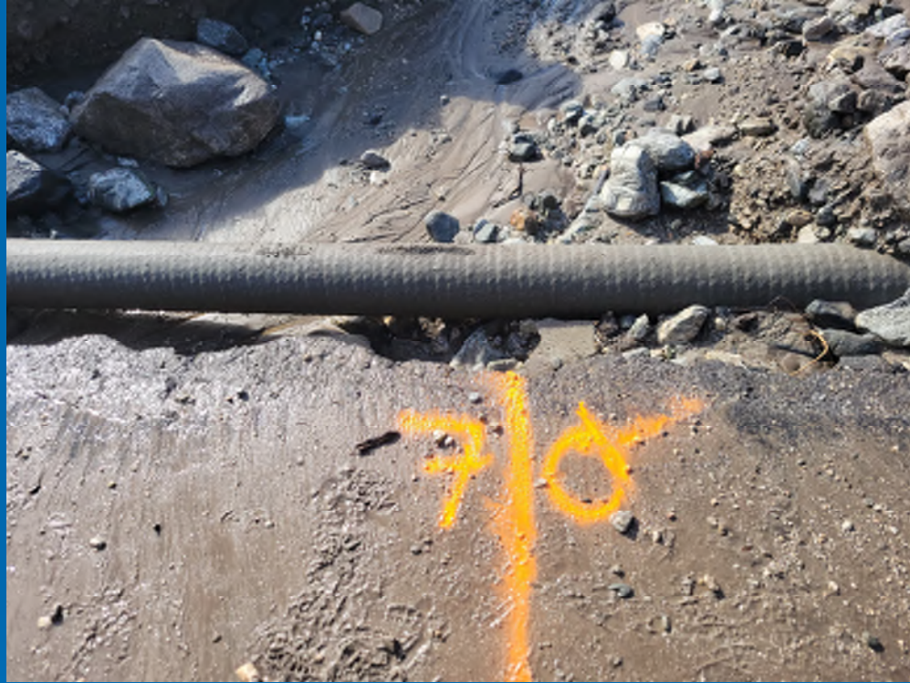
Exposed CML&C Pipe in Noble Street at location of scour from debris flow in Noble Creek