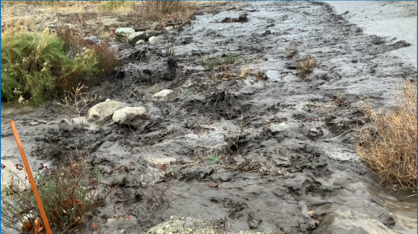
Noble Creek crossing at Noble Street, southeast of Orchard Street. Location of required emergency scour repair